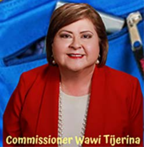
Commissioner Wawi Tijerina